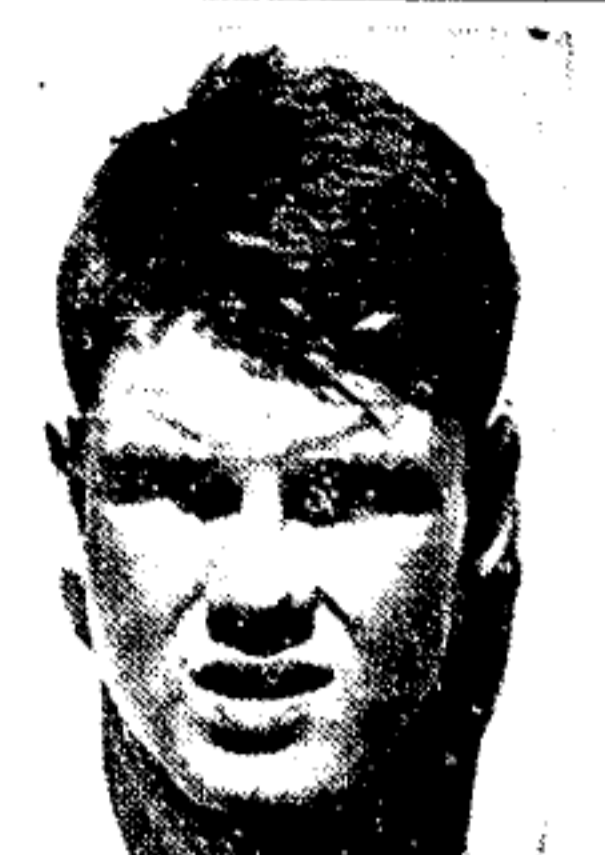
BRONKO NAGURSKI, T Int. Falls, Minn.