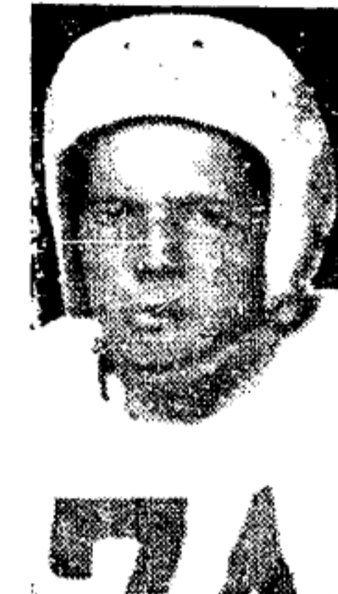
LES SIMERVILLE, B Atlanta, Ga.